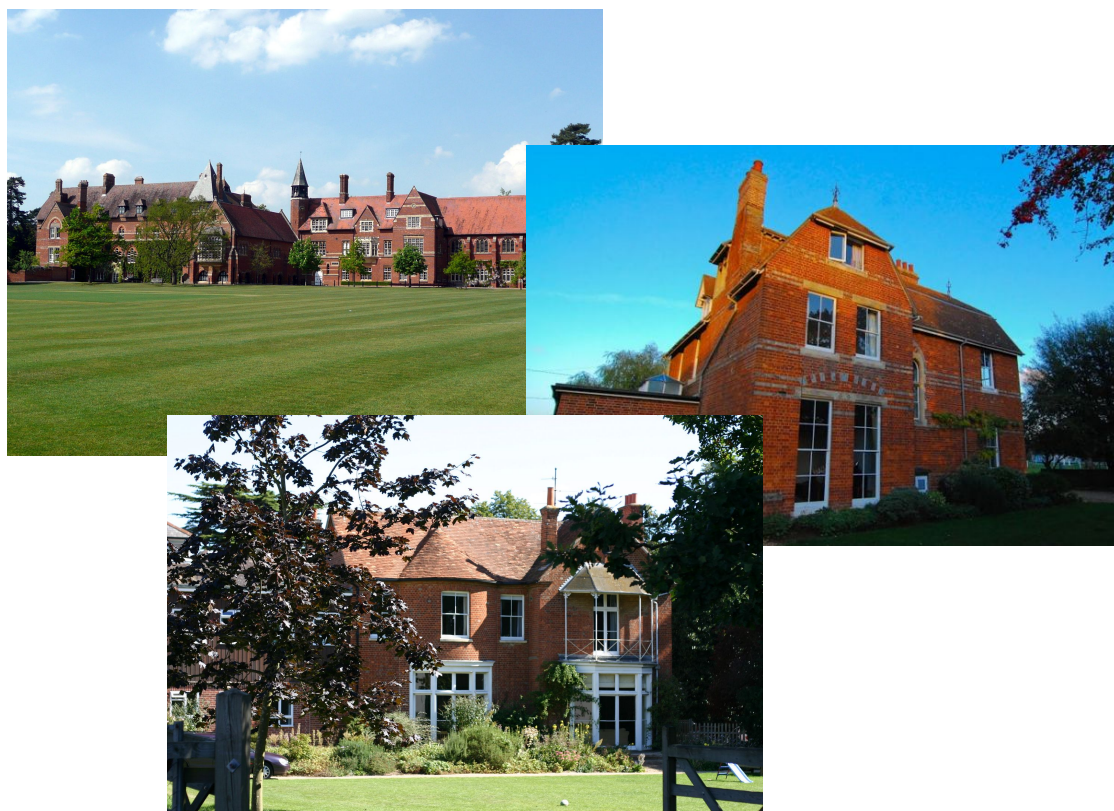
Clockwise from Top Left: School House (to the left of Big School); Crescent House; Austin House

Each house aims to provide you with the opportunity, support and encouragement necessary for you to achieve academic success, develop self-confidence and independence and become a concerned and responsible member of society. The house is a community that will help you through the challenges you will face in your time at Abingdon School and that will celebrate your successes and achievements. Crucially it is a place where you will form friendships and learn social skills that will last you for the rest of your life. The house combines boarders and day pupils aged 13-18 years old. The house, therefore, offers opportunities for day pupils and boarders to get to know one another, for day pupils to convert to boarding and for pupils to experience a range of cultures. You should make sure you make the most of this. Day boys are very much part of each house and are expected to follow its rules. They are also expected to recognise that the house is the boarders' home, and to treat it with appropriate respect.